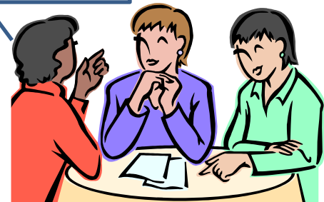
3. Session Sharing / Making Change Happen